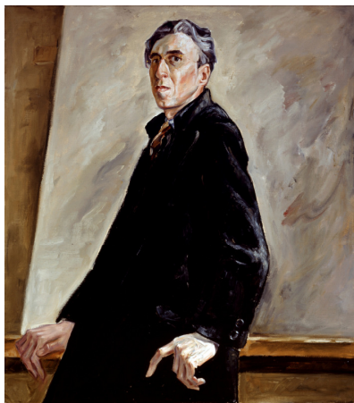
Self Portrait (PH-382), 1940